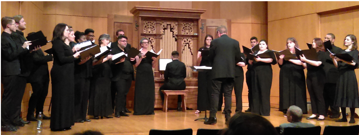
Early Music Vocal Ensemble of SHSU and the Bach Society Houston performing Vespers for St. Caecilia's Day.

The Society sponsors the following: an annual conference; a scholarly journal ( Early Keyboard Journal ); a semi-annual newsletter; the Jurow International Harpsichord Competition; the Alienor International Harpsichord Composition Competition; and scholarship opportunities.