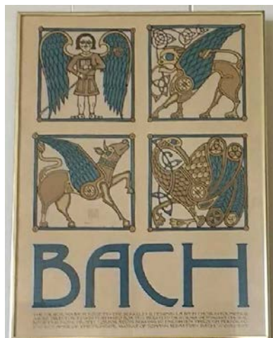
Framed Bach Poster 19" x 24"

Adopt a piece of early music art. Perfect for your home, music room, or studio.