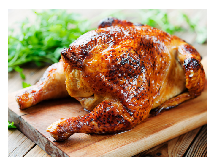
Pullum bene deplumatum exinanitum et lotum assabis; asso atque in patina imposito, antequam refrigerat, aut succum mali citrer

The second is one of those medieval/ Renaissance dishes that is just a way to flavor already cooked chicken, especially convenient now that you can get roast chicken in a supermarket and scarcely need any measurements. The flavor is strikingly like medieval Middle Eastern food.